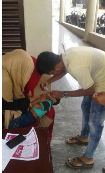
NSS volunteers helping at the polio booth