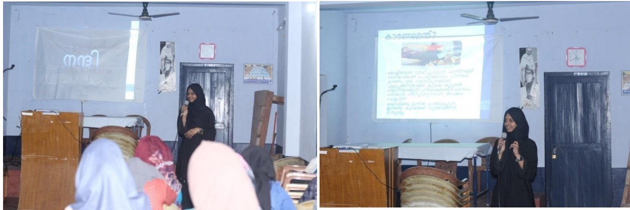
NSS volunteer addressing on diseases caused by the consumption of fast food

The second session was based on communicable diseases presented by Ms. Aardhra (NSS Student Volunteer). The lecture highlighted some of the common communicable diseases. Its mode of transport, causes, prevention, cure and treatment. Both the sessions were related to the common health issues faced today.