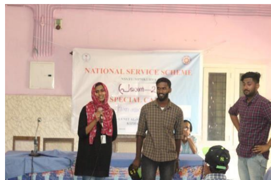
Health survey feed back session