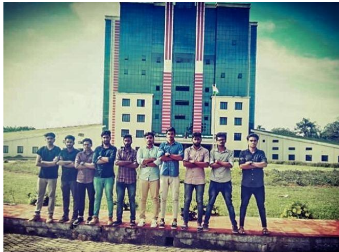
NSS Volunteers at KUHAS