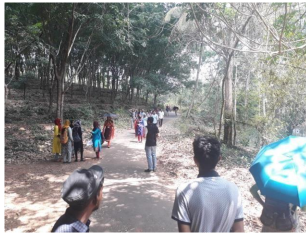
NSS volunteers on the way to Ambalapara colony for health survey

The day followed by lunch and refreshments prepared by NSS Volunteers. Soon after the lunch, there was an informative session conducted by NSS volunteers at Vyaparabhavan. An informative awareness presentation on diseases due to consumption of fast food was presented by Ms. Akeela (NSS student volunteer). The session was addressed on the disease caused by unhygienic fast food, how it hampers body functioning and the epidemics caused by contamination of these food stuffs.