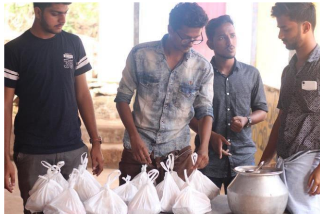
Food meals packed for patients