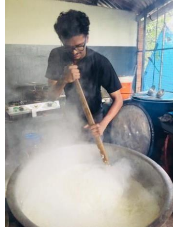
Meal preparation by NSS volunteers