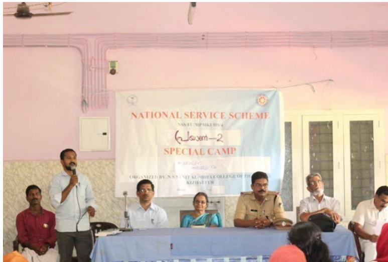
NSS CAMP PRAYAN 2 closing ceremony