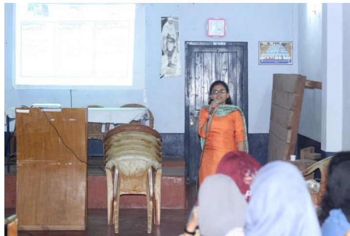
Presentation by NSS volunteer on various communicable diseases

The second session was based on communicable diseases presented by Ms. Aardhra (NSS Student Volunteer). The lecture highlighted some of the common communicable diseases. Its mode of transport, causes, prevention, cure and treatment. Both the sessions were related to the common health issues faced today.