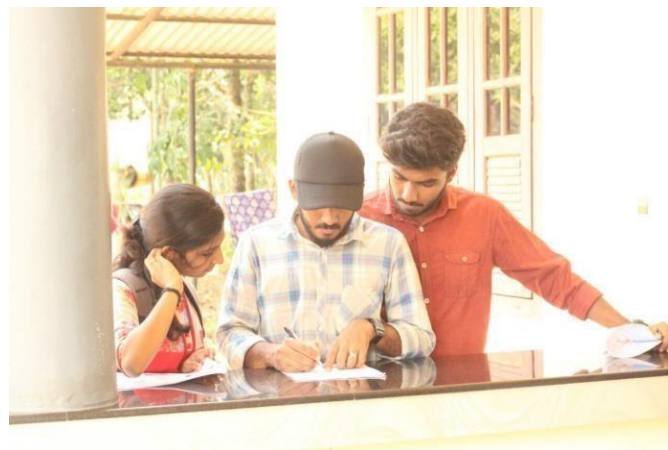
NSS student volunteers doing survey

Inauguration programme at town vayanshaala