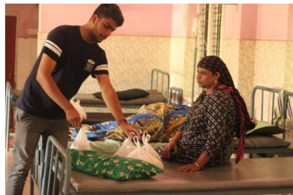
Meal parcels delivered to patients