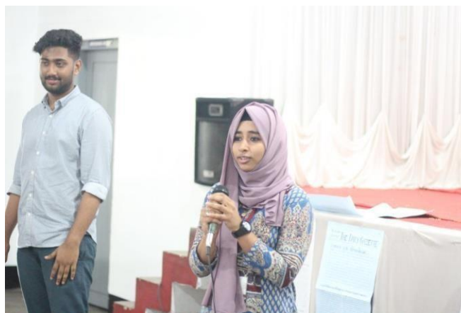
Cultural events conducted by NSS Volunteers

At the end the day 6 was successful. The day was focused on the problems and solution based on physical and mental health.