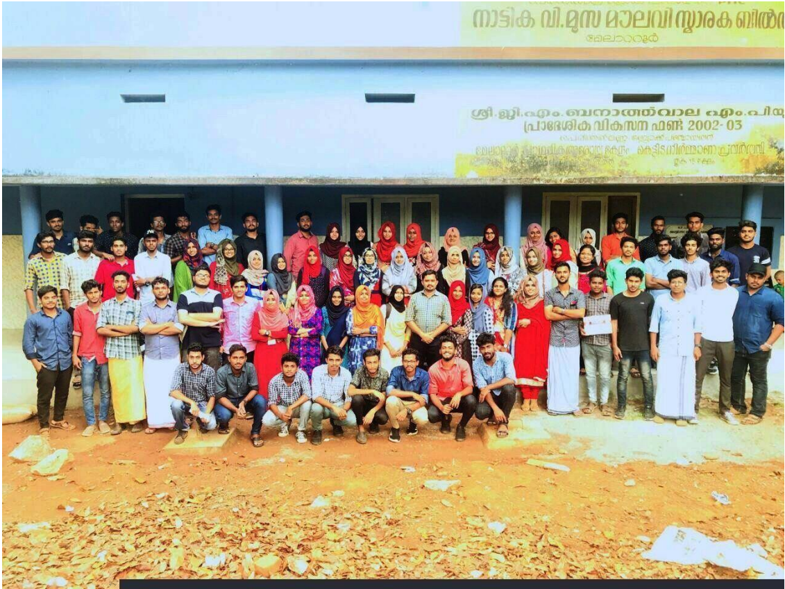
NSS VOLUNTEERS AT NSS CAMP PRAYAN-2

Alas! The success of NSS initiative was remarkable and an example for the budding generation. The NSS camp PRAYAN 2 proved to be of great benefit to the Melattur society. The volunteers realized their responsibilities towards the society and their participation in a healthy environment. Understanding role as citizens and as an individual towards the development of the country.