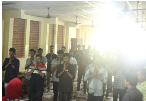
NSS volunteers performing yoga