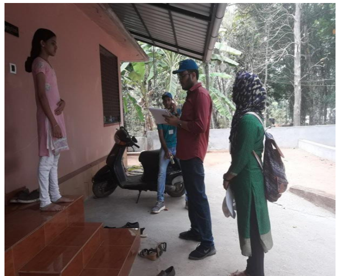
NSS volunteers during health survey