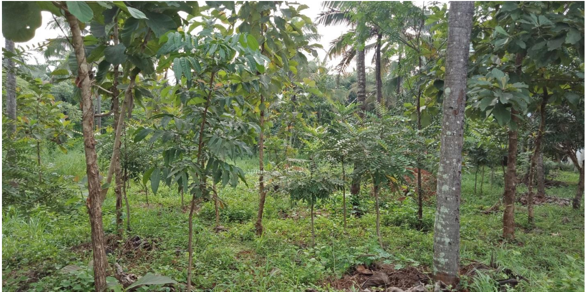
3 years old plants like Mahagony, Ungu etc..