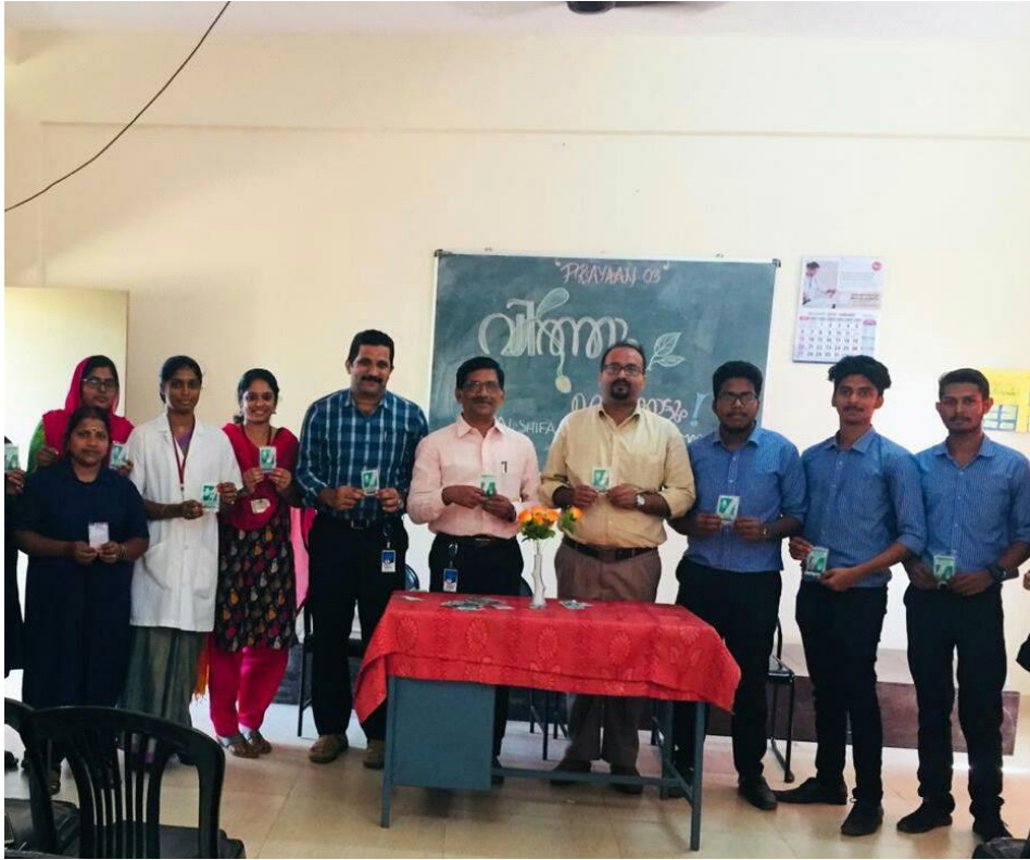
Vithum kaikkotum—Principal, Vice Principal and other faculties