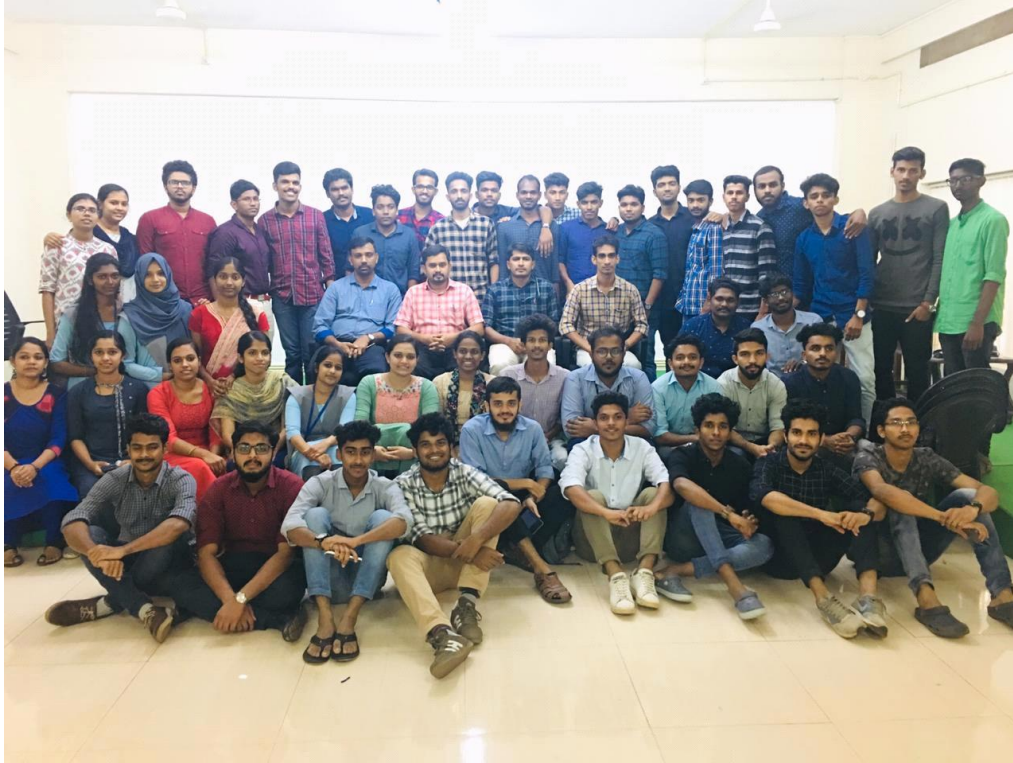
BLS- Mruthyunjayam training at JDT Calicut