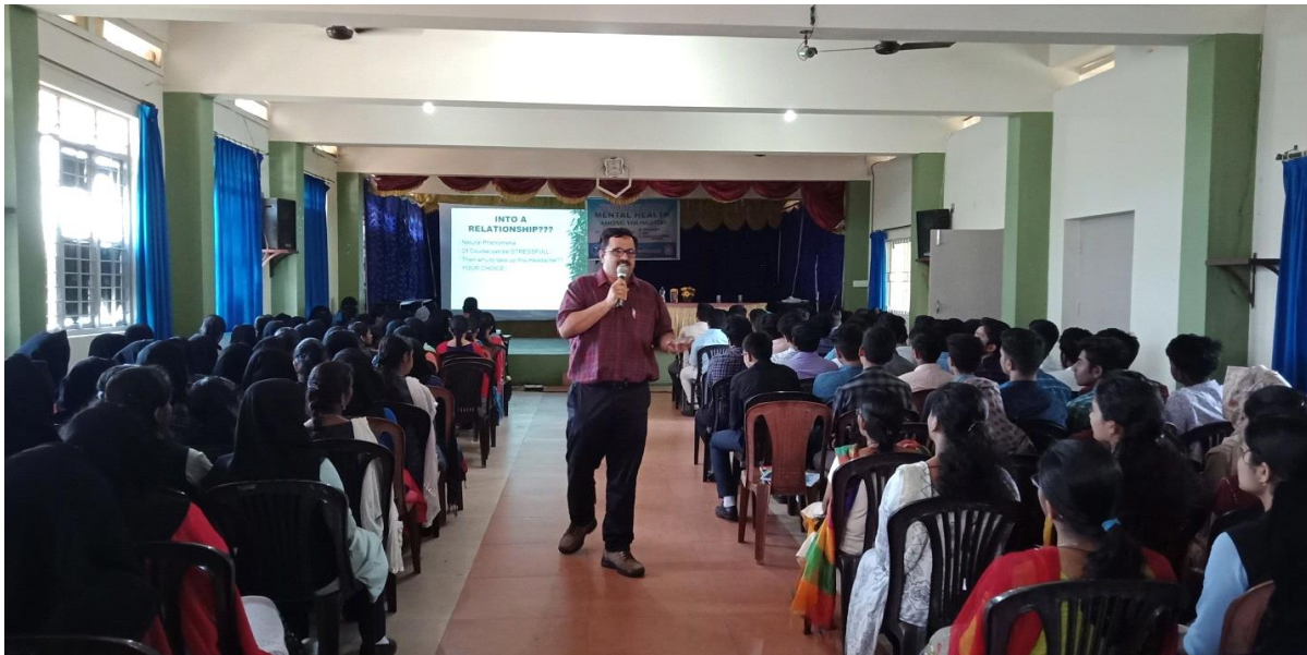
Mental health awareness program