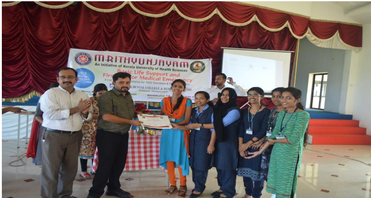
BLS- Mruthyunjayam training at Malabar dental college