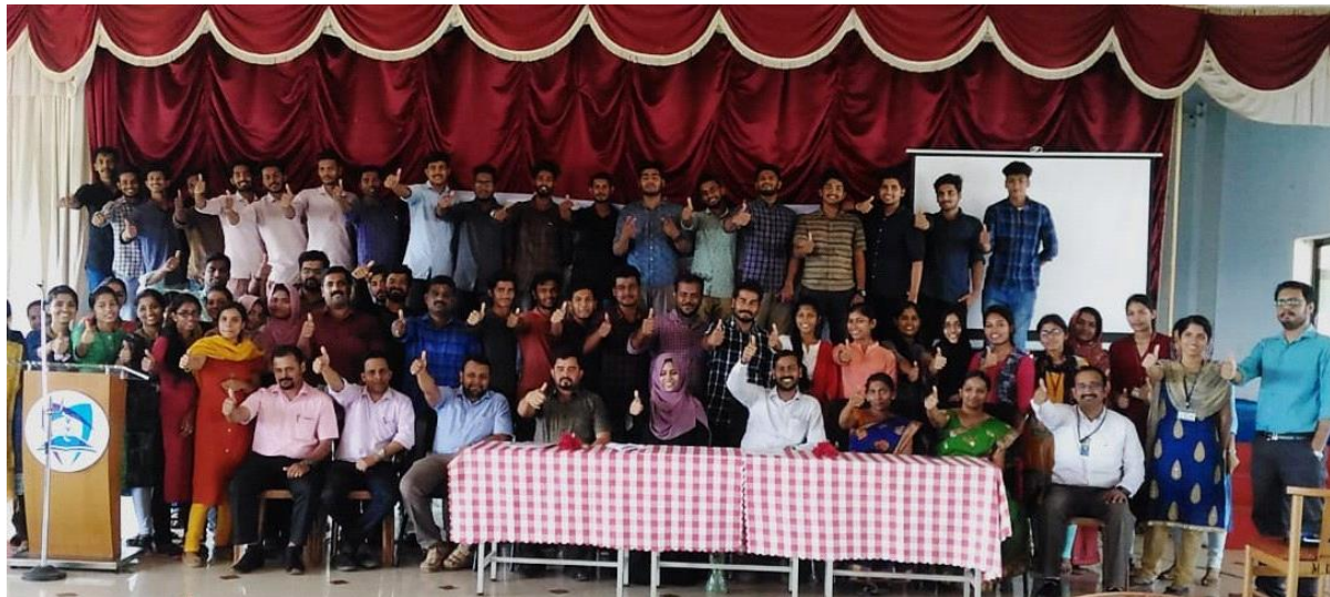
Mruthyunjayam training at Malabar dental college

13) Participation in National programmes like Pre-RD Camp, RD Camp, National Integration Camp National Youth Festivals etc