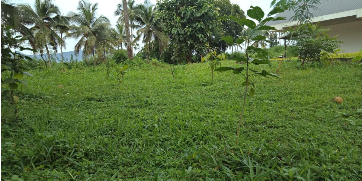
One year old saplings.