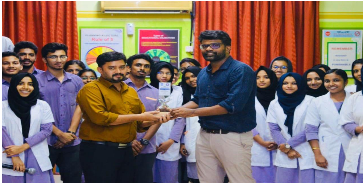
MES Medical College