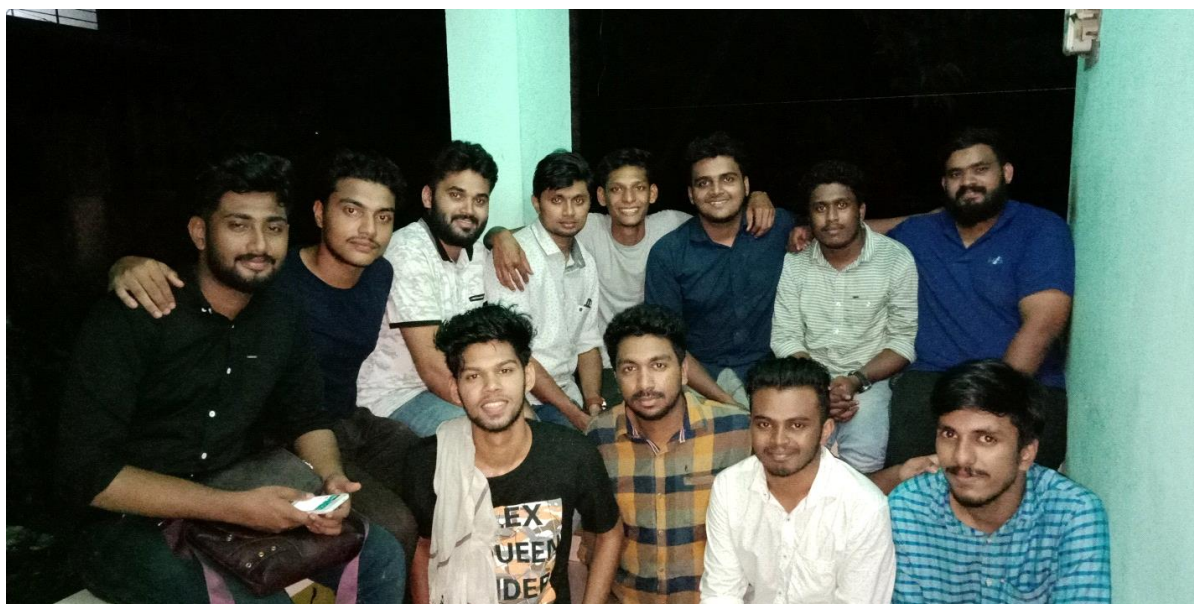
NSS volunteers to Kodungallur and Paravoor