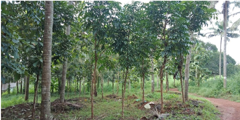
3 to 10 year old trees