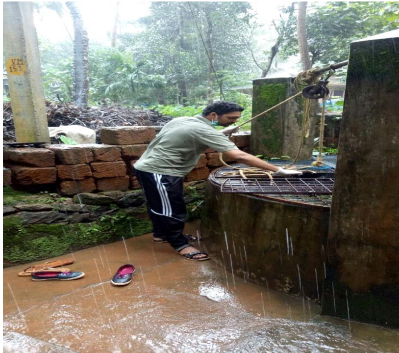
Cleaning and super chlorination at malappuram