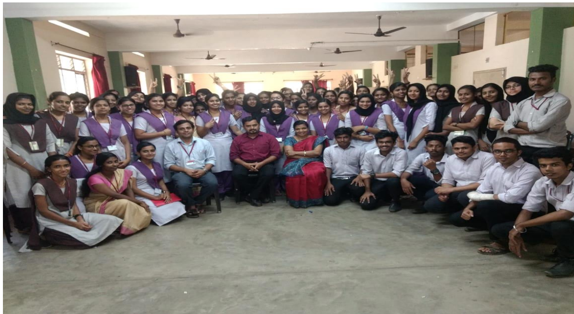
Al Shifa college of nursing