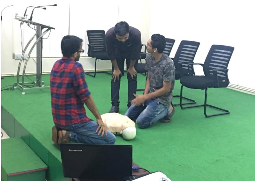
BLS- Mruthyunjayam training at JDT Calicut