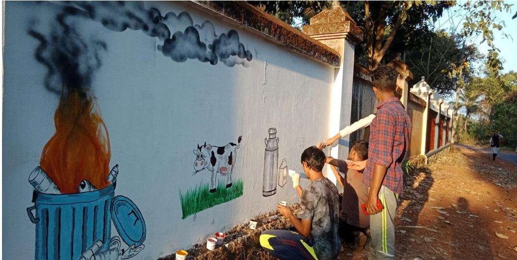
Wall art against plastic

10) The initiatives taken by the Programme Officer and the Principal in strengthening the NSS programmes.