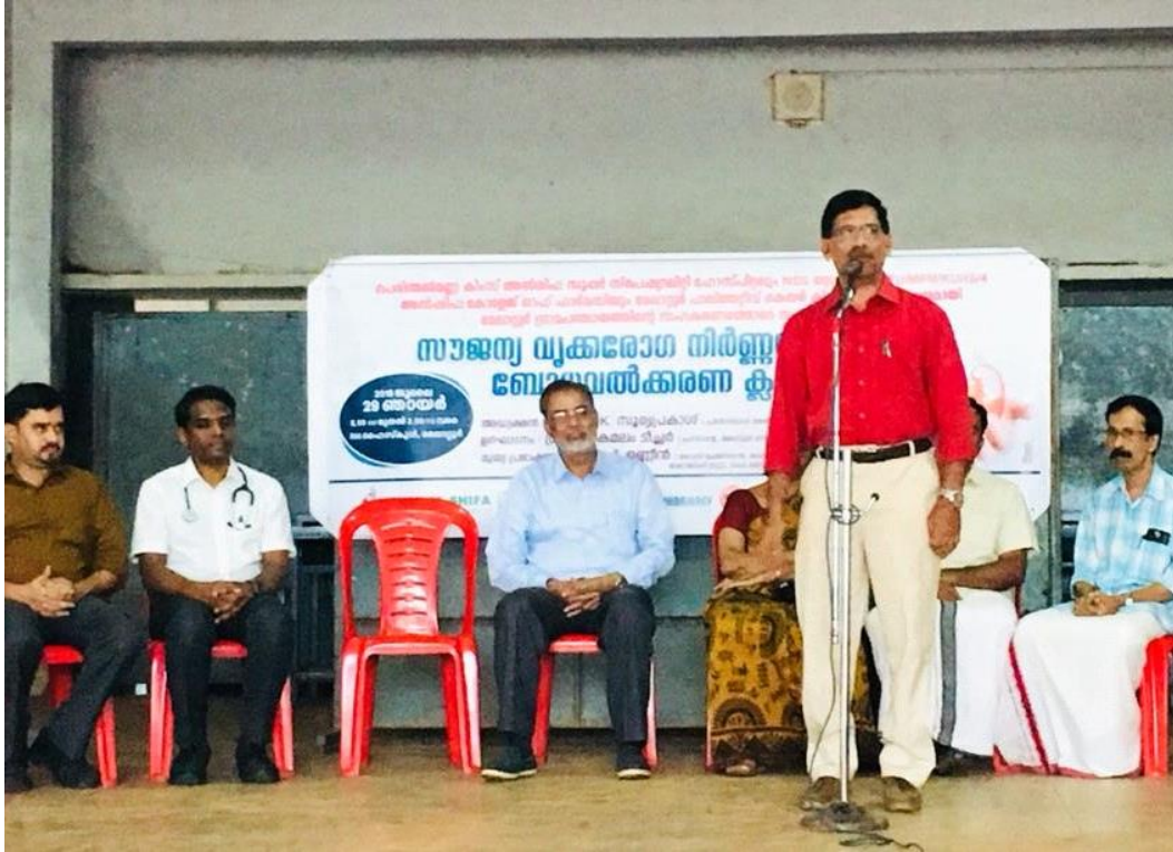
Kidney disease detection camp