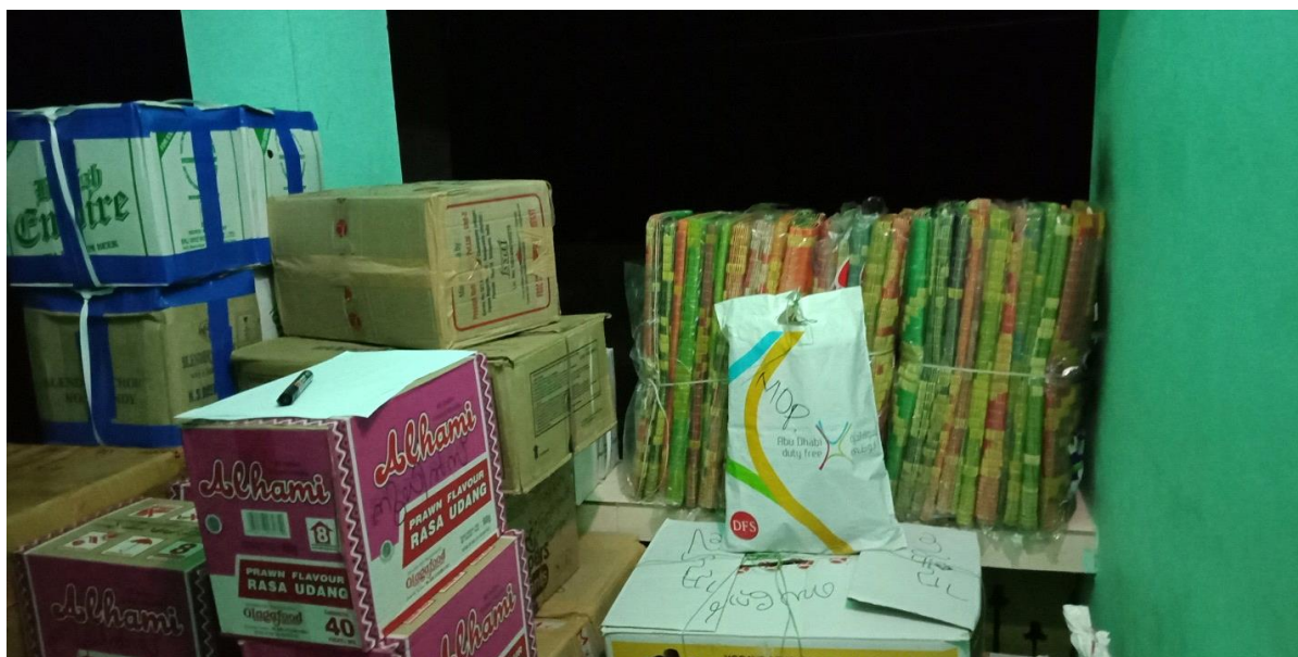
House hold items to Kodungallur and Paravoor