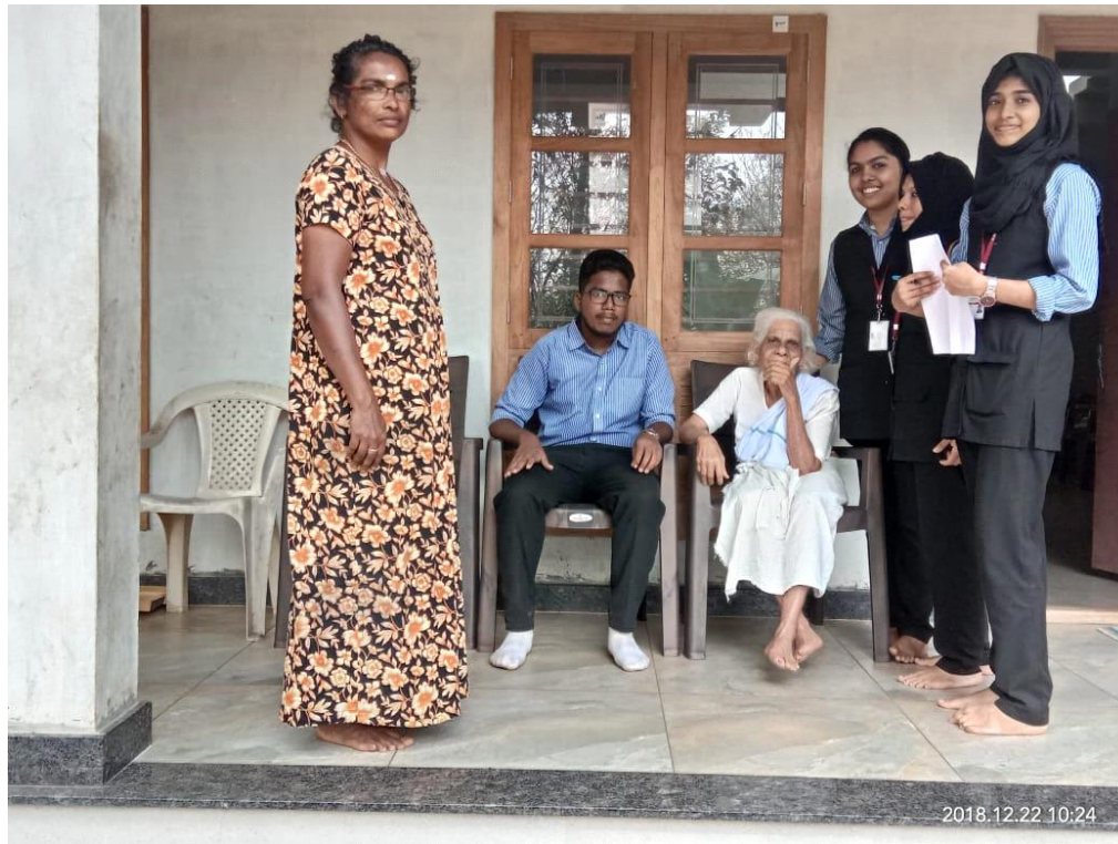
Awareness regarding sanitation & plastic use