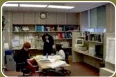
Drug Information Centre