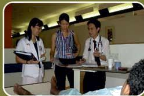
Ward Round Participation