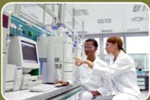
Bio Analytical Research